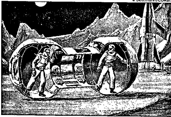
ADDING A NEW DIMENSION

"Terrestrial 3D printing technology has produced entire structures. Our industrial team investigated if it could similarly be employed to build a lunar habitat," said