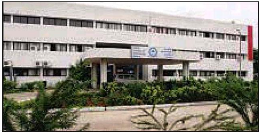
■ IIT buliding on PACL campus near Mhow.

Students of all the four years would participate in the event. "This one would be intra IIT-I event and later in March we would hold this conference